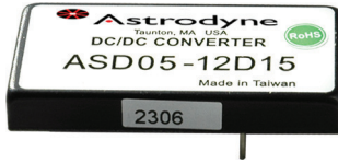
Unit measures 1"W x 2"L x 0.25"H